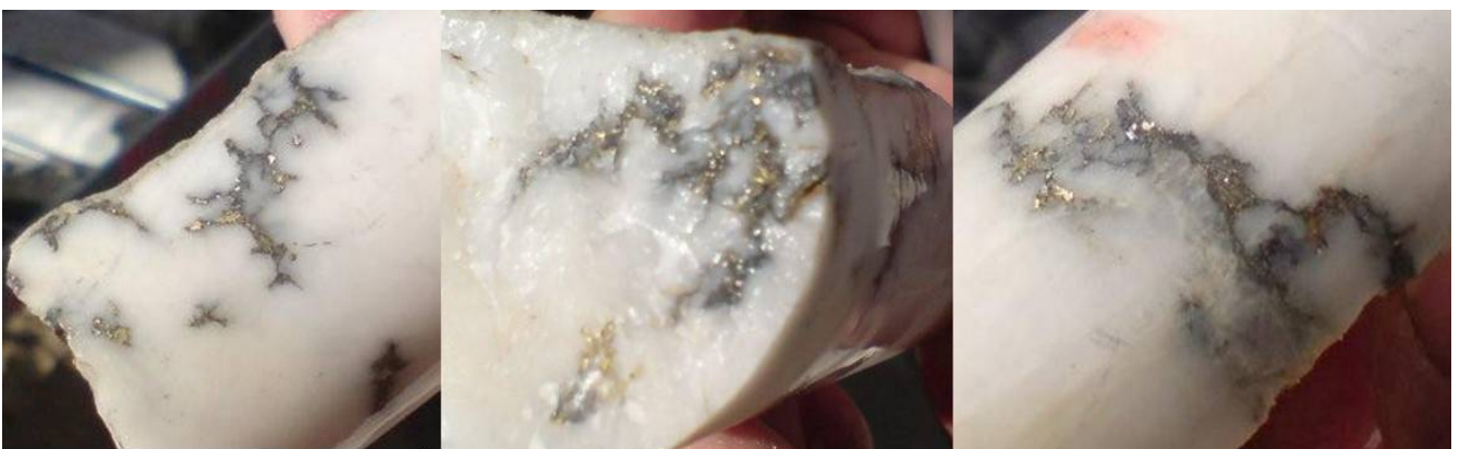
Figure 1 – D1280, 558 – 559m; massive milky quartz vein, gold veinlets and galena, zone beneath Hapi Zone

This deeper structure correlates to 6m @ 15.21g/t Au in hole RCD521 from 542m (figure 2) and 22m @ 21.83g/t Au from 549m in hole RCD1221 25m to the south (announced 21 November 2007).